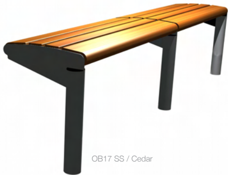
OB17 SS / Cedar