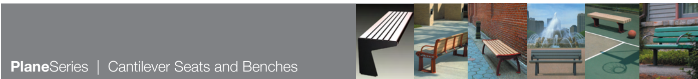
PlaneSeries | Cantilever Seats and Benches