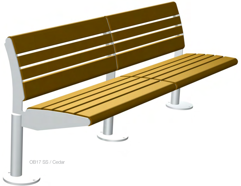
OB17 SS / Cedar