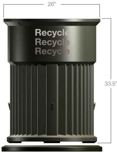
Side View | Top Open | Graphics Only