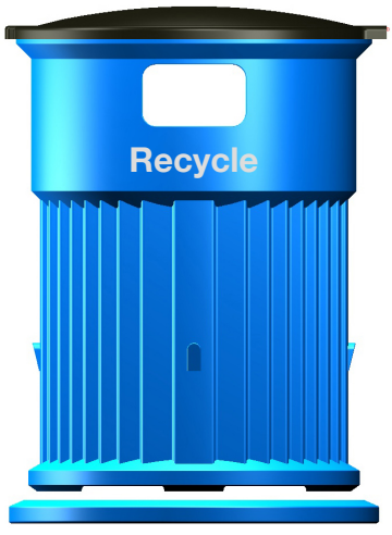
Side View | 4.5" x 7.5" Opening