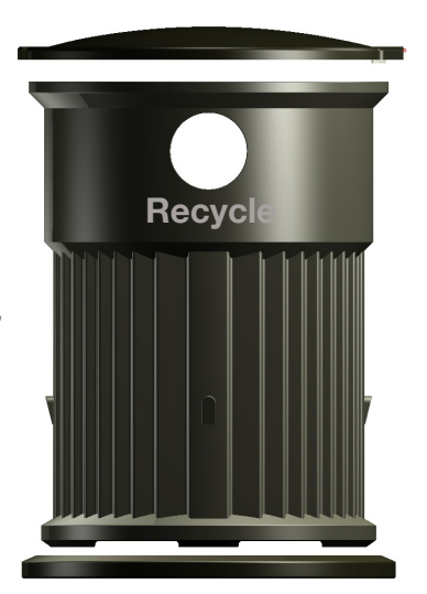
Side View | 5.5" Diameter Opening